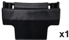
Handle Body (part # P650)