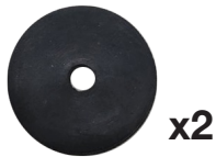
Rubber Washers, 3/16" I.D. (part # H052)