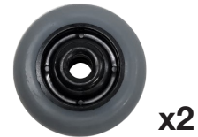
3" Wheels (part # H358B)