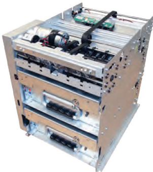
Glory MultiMech™ Bill Dispenser