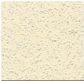
IVORY CHALK T-202