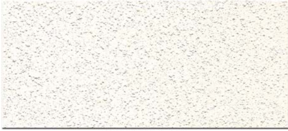
COOL WHITE T-200