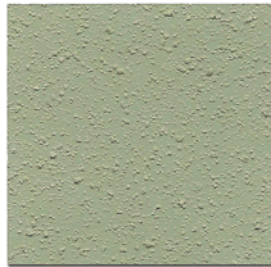
PALE MOSS GREEN T-203