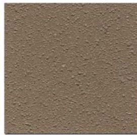
DEEP EARTH T-215