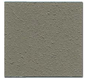
CINDER GREY T-213