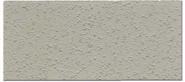
FROST GREY T-201