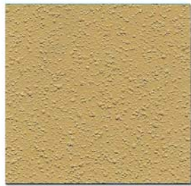
CAMEL BACK T-210