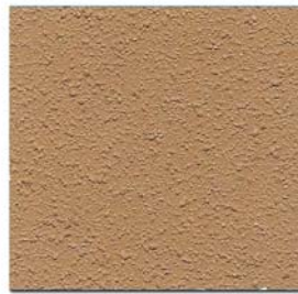
COCOA BEAN T-211