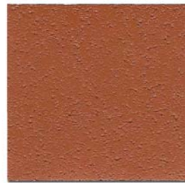
SANTA FE T-216