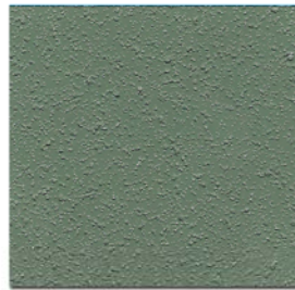
SPRING TURF T-207