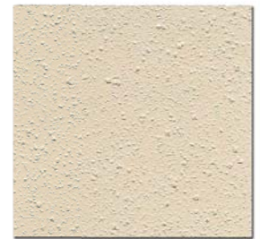
SEQUOIA DUSK T-205