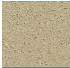
PUTTY BEIGE T-206