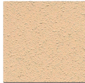
MEXICAN TILE T-204