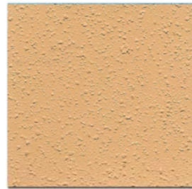
ITALIAN EARTH T-208