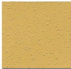
GOLD TORCH T-214